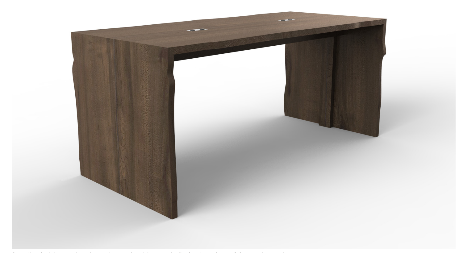
Standing height version shown in Maple with Portobello finish and two COHV1 data units

Our Narada Table as a study in form and function. The fluid lines move the eye; the clean footprint allows a seamless integration into the environment; and the hidden channel offers concealed wire management.