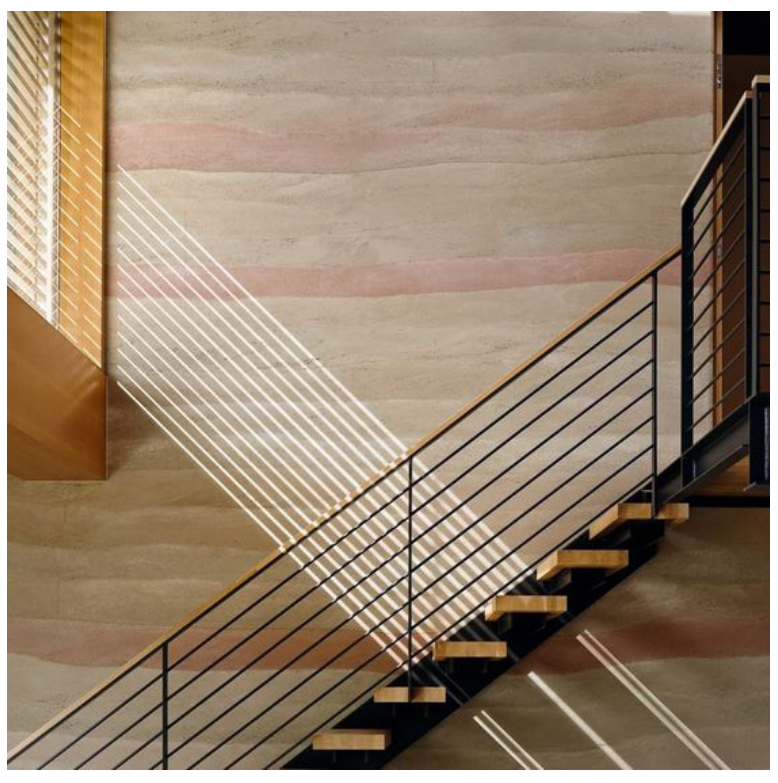
- Visit www.meyerwells.com/products for additional products -