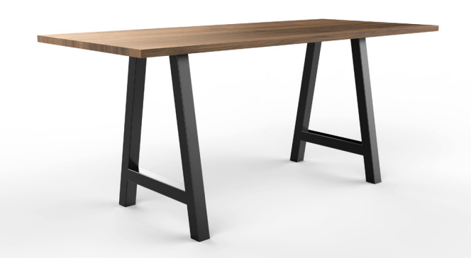
Standing Height version

Steel base allows for concealed wire management; casters available on tables 60" - 96"L