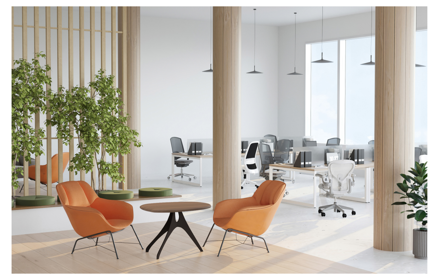
Top Left & Bottom Images: Solid Walnut in Clear with custom edge, base in Matte Black; Top Right Image: Veneered Premium Ply White Oak in Clear with Silhouette Edge, base in Seashell White; Second Right Image: Solid White Oak in Clear with custom edge, base in Seashell White