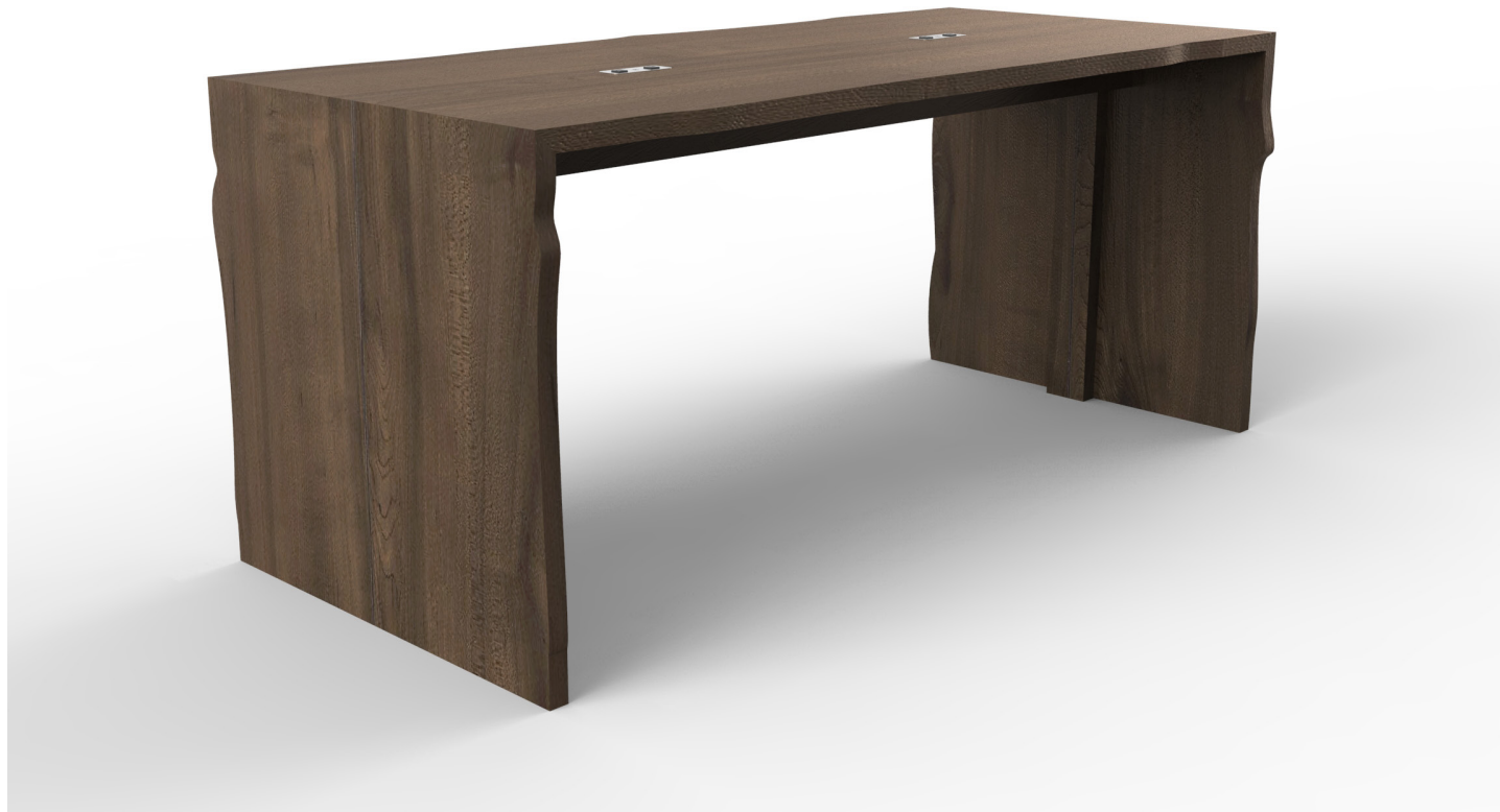
Standing height version shown in Maple with Portobello finish and two COHV1 data units

Our Narada Table as a study in form and function. The fluid lines move the eye; the clean footprint allows a seamless integration into the environment; and the hidden channel offers concealed wire management.